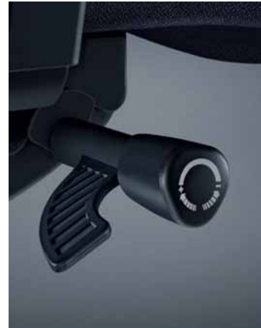
Large lever for weight regulation and seat height adjustment which is intuitive to use