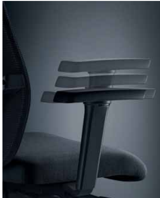
4D T armrests, adjustable in four directions with soft arm pads