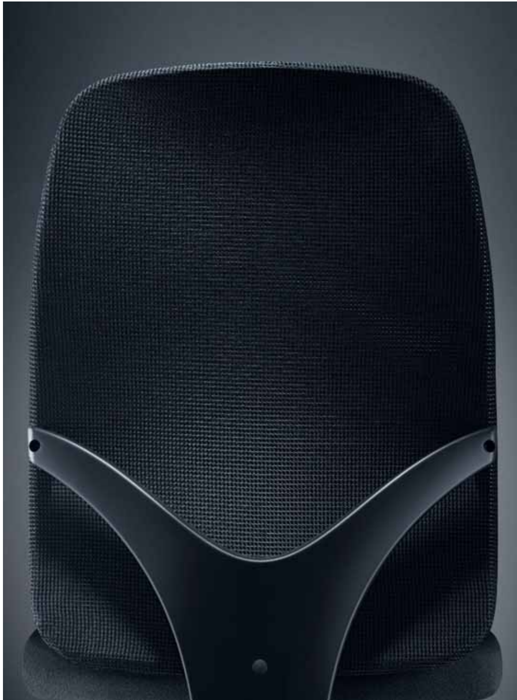
Geos characteristic features: the V-shaped back support