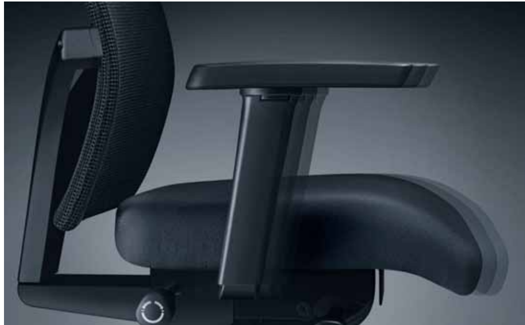
Seat depth and inclination can be individually adjusted in a single operation